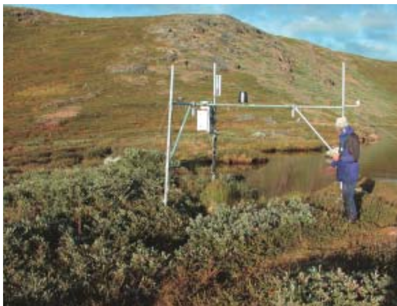
Fig. 2. The hydrological station at the outflow from Lake G in August. The more extensive vegetation growth is apparent despite there being no flow from the lake.

In an attempt to integrate some of the contrasting but complementary aspects of lake-climate-catchment interactions in West Greenland, it was decided to focus specifically on a limited number of lakes and their catchment hydrology. Two neighbouring lakes were chosen, one with an outflow and one without, but both experiencing a similar regional climate and having similar geology and vegetation. The aim is an integrated study that combines an energy and hydrological mass balance of two contrasting lake catchments with measurements of contemporary and long-term sedimentation in the